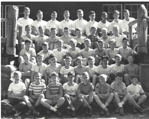
1948 Camp Pocono Buck Campers and Counselors