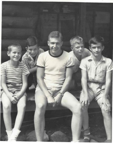
Uncle Arta cabin

"The camp had between 90 and 110 campers. There were 4 age groups: Cub Camp (ages 6 - 8), Colt Camp (ages 9-10), Buck Camp (11-12) and Eagle Camp (ages 13-15). Campers stayed for a month to eight weeks each summer with some returning as camp counselors as they grew older.