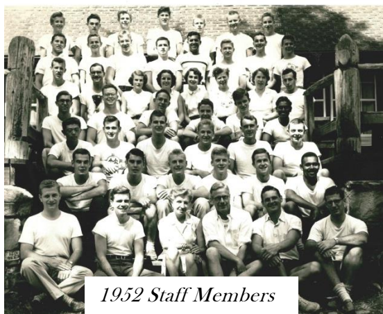
1952 Staff Members