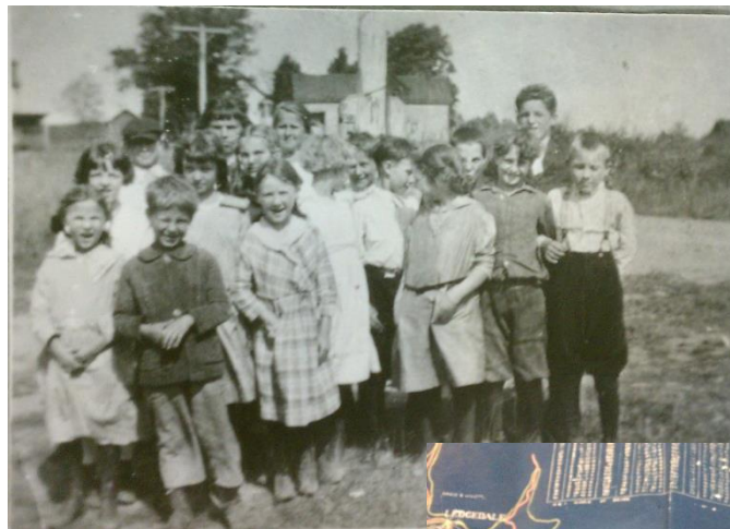
The Tafton School 1921